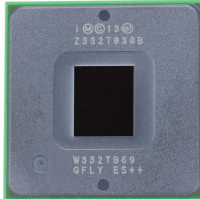
Figure 1-1 Example Component with Identifying Marks