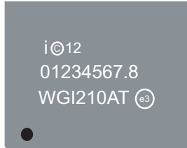
Figure 1-2 I210 Production Top Marking Example (Commercial Temperature Copper)