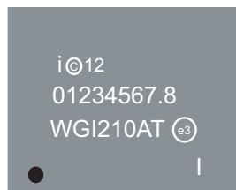
Figure 1-3 I210 Production Top Marking Example (Industrial Temperature Copper)