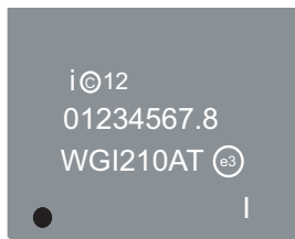
Figure 1-3 I210 Production Top Marking Example (Industrial Temperature Copper)