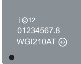
Figure 1-2 I210 Production Top Marking Example (Commercial Temperature Copper)