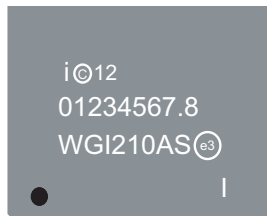
Figure 1-4 I210 Production Top Marking Example (Industrial Temperature Fiber)