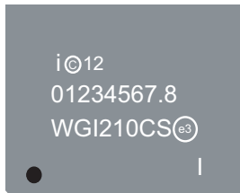
Figure 1-5 I210 Production Top Marking Example (Automotive Industrial Temperature Fiber)