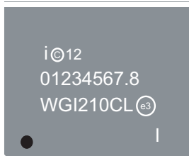
Figure 1-6 I210 Production Top Marking Example (Automotive Industrial Temperature Fiber <20 DPM)