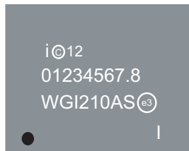
Figure 1-4 I210 Production Top Marking Example (Industrial Temperature Fiber)