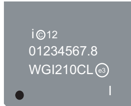
Figure 1-6 I210 Production Top Marking Example (Automotive Industrial Temperature Fiber <20 DPM)