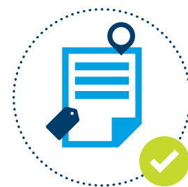
Figure 2. IBM Cloud Secure Virtualization* provides data sovereignty controls such as encryption, audit and compliance readiness, and operational risk management.

Set policies and security controls for automated boundary enforcement