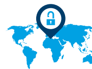
Data Decryption by Location