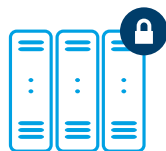
Server Platform Integrity