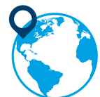
Deployment Control by Location