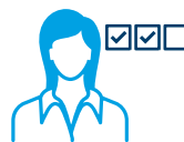
Privileged User Controls