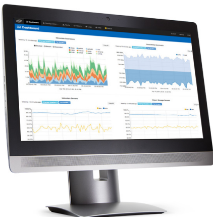
Figure 1. Intel® Manager for Lustre* Dashboard