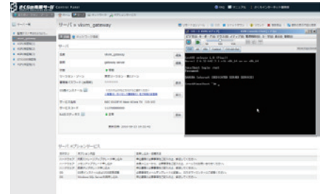
Control panel for dedicated server service

Moving forward, studies are continuing on implementing a "health check function"