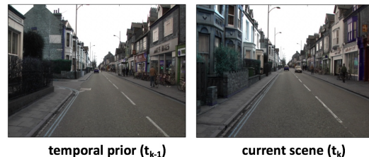
Figure 1. Scene Prior. The image on the left is a temporal prior (one second previous) to the image on the right (representing the current scene).

such as cars and pedestrians, are mobile and are not in the same location between frames (or time steps). The appearance of the scene can shift slightly, depending on the speed of the objects. Therefore, it can be difficult to discern which semantic labels to propagate from the prior to accurately inform the current scene. Naive approaches for selection, such as estimating the motion shift between frames, are more useful for static scenes. Here we use a learned module to determine from raw driving data how to propagate information from the prior.