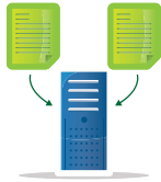
Limits on virtualization

AGED INFRASTRUCTURE SLOW AND DIFFICULT TO MAINTAIN