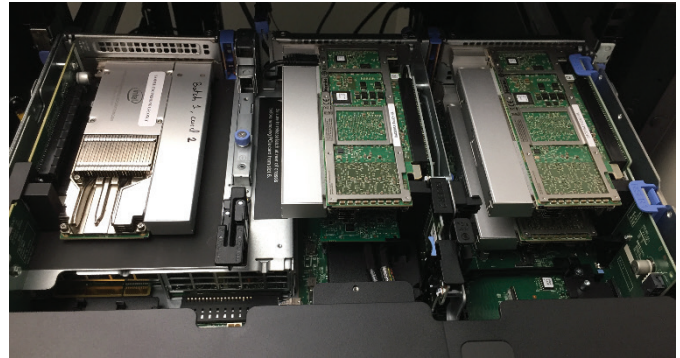
Figure 2. Actual Image of the Server Setup