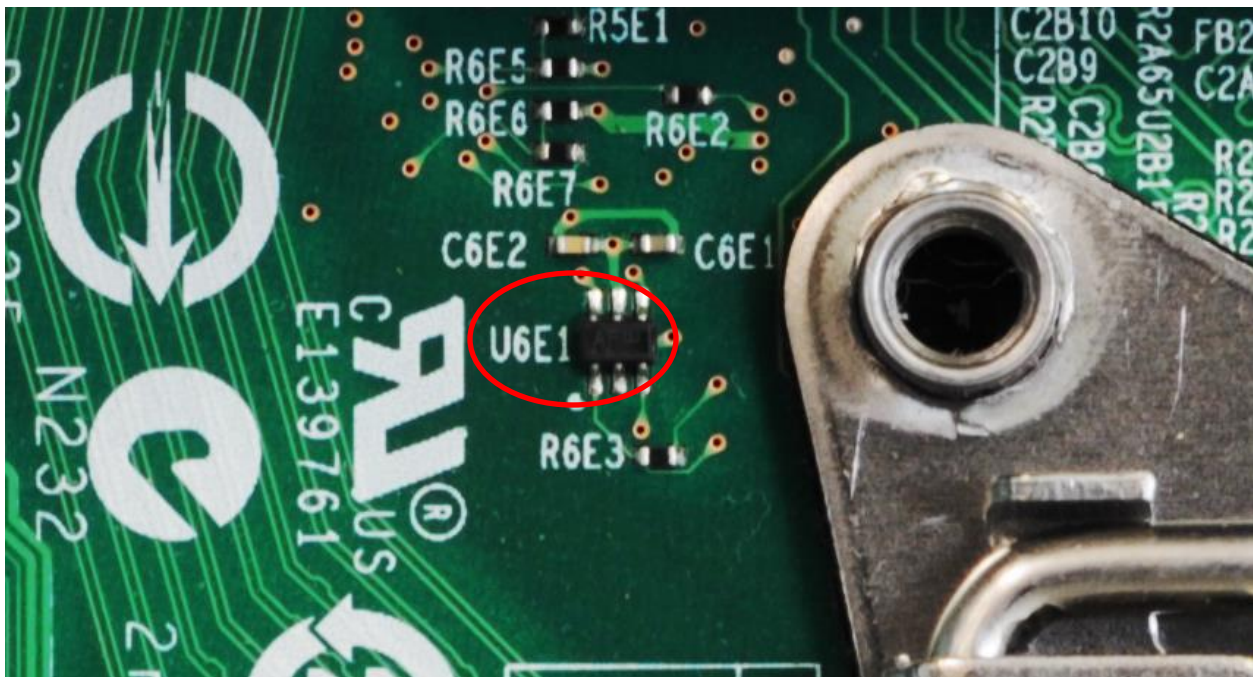
Figure-2b: An Example of Location of the Switch Symbol U6E1 on S2600CP2