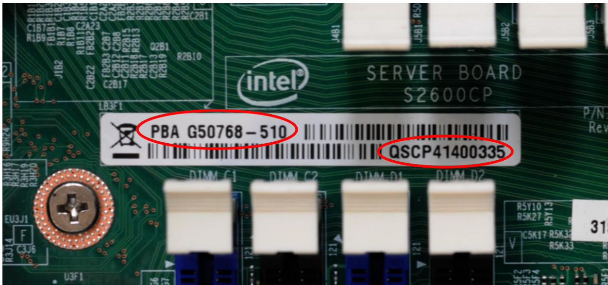
Figure-1a: An Example of PBA Number and Serial Number on Server Board