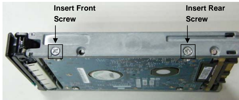
Figure 5: Insert screws into 2.5" Drive Carrier holes

An image of the finished 2.5" drive carrier assembly with AXXTM3SATA board and bracket is shown in Figure 6.