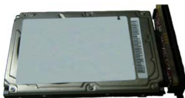
Figure 3: Hard drive connected to the AXXTM3SATA assembly