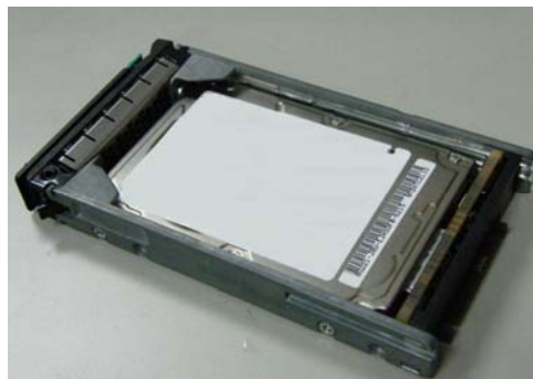
Figure 6: Finished assembly of the 2.5" Drive Carrier

An image of the finished 2.5" drive carrier assembly with AXXTM3SATA board and bracket is shown in Figure 6.