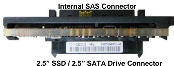
Figure 2: Preassembled AXXTM3SATA Board and Bracket Assembly