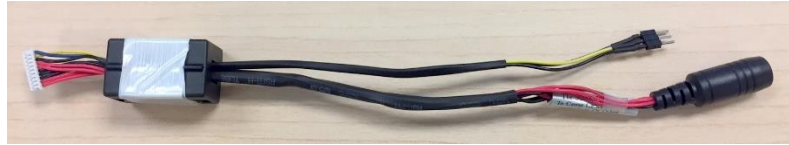
Figure 2. Power + UART Cable

The pinout for the Power + UART connector is shown in Table 1. Connector Pin 1 is identified on the printed circuit board with the white triangle.