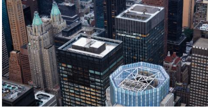
Smart Cities / Safe Cities