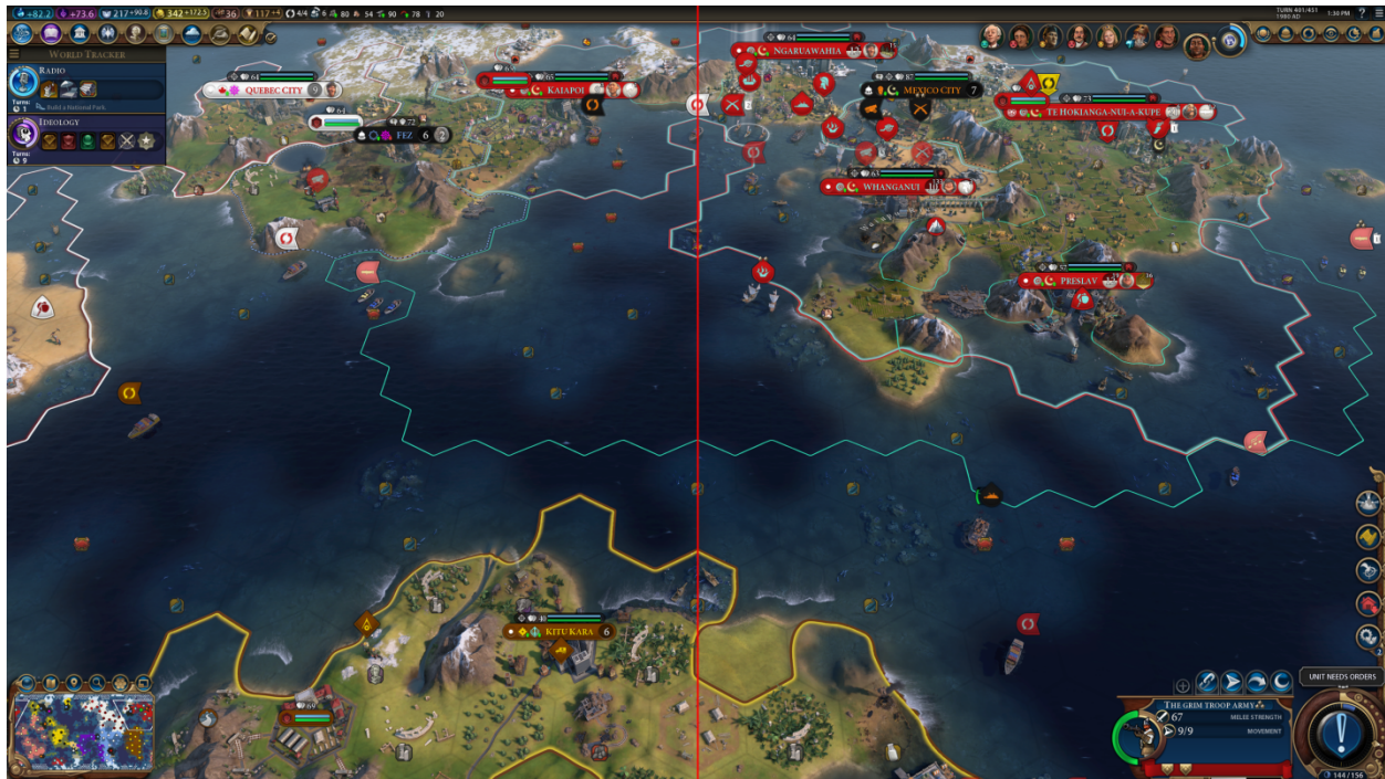
Figure 3. Civilization VI demo from Firaxis Games and Microsoft: the left side has VRS enabled, and is running considerably faster, yet the quality of both sides is near-identical.

Hardware support for VRS is still developing, but it will receive a boost later in 2019 with Intel's new Gen11 graphics hardware. Going forward, Gen11 will boost the performance of nearly every mainstream Intel® processor.