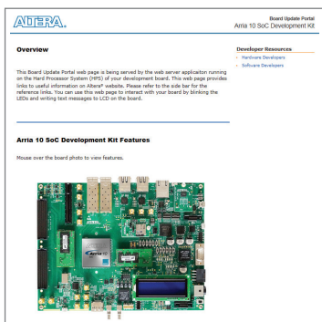
Figure 1. Board Update Portal