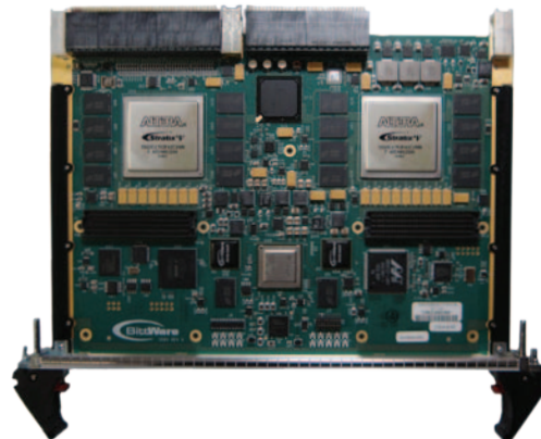
Configuration via Protocol (CvP) Supported

B ittWare's S5-6U-VPX (S56X) is a rugged 6U VPX card based on the high-bandwidth, power-efficient Altera Stratix V GX/GS FPGA. Designed for high-end applications, the Stratix V provides a high level of system integration and flexibility for I/O, routing, and processing. An ARM® Cortex™-A8 control processor provides a complete control plane interface; and a configurable 48-port multi-gigabit transceiver interface supports a variety of protocols, including Serial RapidIO, PCI Express, and 10GigE. The board features up to 8 GB of DDR3 SDRAM as well as Flash memory for booting the FPGAs. Providing additional flexibility are two VITA 57 FMC sites for enhancing the board's I/O and processing capabilities. The S56X also features a Board Management Controller (BMC) for advanced system monitoring, which greatly simplifies platform management. All of these features combine to make the S56X a versatile and efficient solution for creating and deploying high-performance FPGA computing systems.