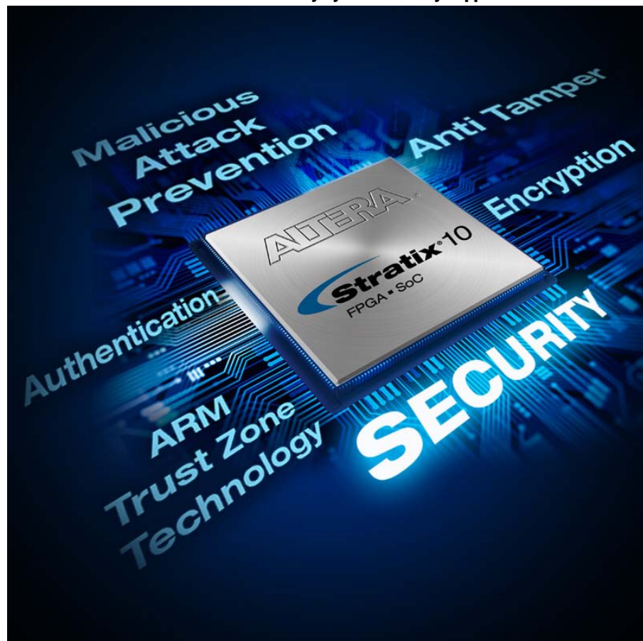
Figure 2. Next-Generation FPGAs Contain Many System Security Support Functions

Also, FPGA-based network products cannot be altered via a network connection or front door attack. If there is an attempt to alter the design, either the anti-tamper mechanisms or fail-safe design feature will detect and shut down the product.