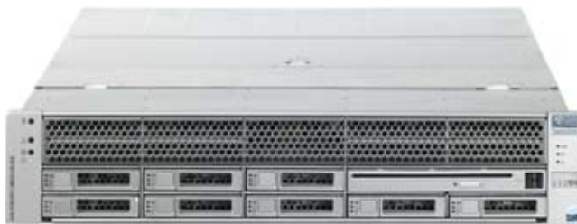
Figure 2. Sun Fire™ 4450

Synapse's Active Device Management System (ADMS) code base runs on the Solaris operating system, which has a strong reputation for reliability, scalability and service. However, the performance of the former platform was failing to scale and handle mobile networks above 20 million subscribers