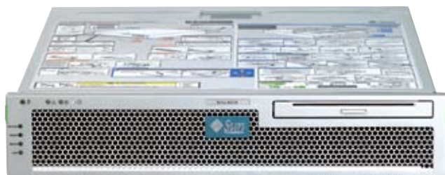
Sun Netra X4250 Carrier-Grade Server

Targeting dense data centers, Sun developed a chassis that optimizes cooling and power efficiency and offers industry-leading energy efficiency and performance in a small form factor. The result is a 2 rack mount unit (2RU) server platform that supports up to four processors (16-CPU cores), 128 gigabyte of memory and over one terabyte of internal storage. Based on this platform, the Sun Fire X4450 and Sun Fire X4150 servers can be used for horizontal database and other disk-intensive applications. The Sun Fire X4450 offers up to twice the compute power and memory capacity, and as much as 50 percent lower energy consumption as competitive servers, resulting in reduced energy and cooling costs. This industry-leading performance density allows operators to do more with less equipment.