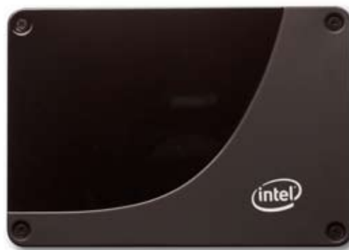
Figure 3. Intel® X25-E SATA Solid-State Drive

The ADMS is an I/O intensive system that handles and stores thousands of incoming events per second, which are randomly distributed in a database with 100 million entries or more. By replacing the conventional rotational hard drives with Intel SSDs, the ADMS has rebalanced the level between I/O and CPU capacity. It's possible to replace up to fifty high-RPM hard disk drives with one Intel X25-E Extreme SATA Solid-State Drive and handle the same computing workload while using less space and power.