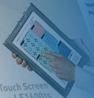
Touch Screen LE1600ts

LE1600 Tablet PCs Full-sized, full-featured, full-powered Tablet Computers - 12.1"