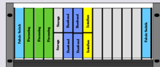
Figure 3. Extending AdvancedMC to MicroTCA chassis (support for Single (75 mm) or Double-Wide (150 mm) AdvancedMC cards)