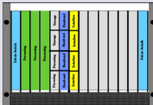
Figure 2. AdvancedTCA shelf subsystem (12U chassis with 8U cards) with AdvancedMC Baseband RF, Storage, Processing and Interface cards

up to 48 AMC cards in a full width ATCA chassis or 12 half-height, single-width AMCs may be hosted within a single width MicroTCA chassis. MicroTCA standard also supports double width AMC cards.