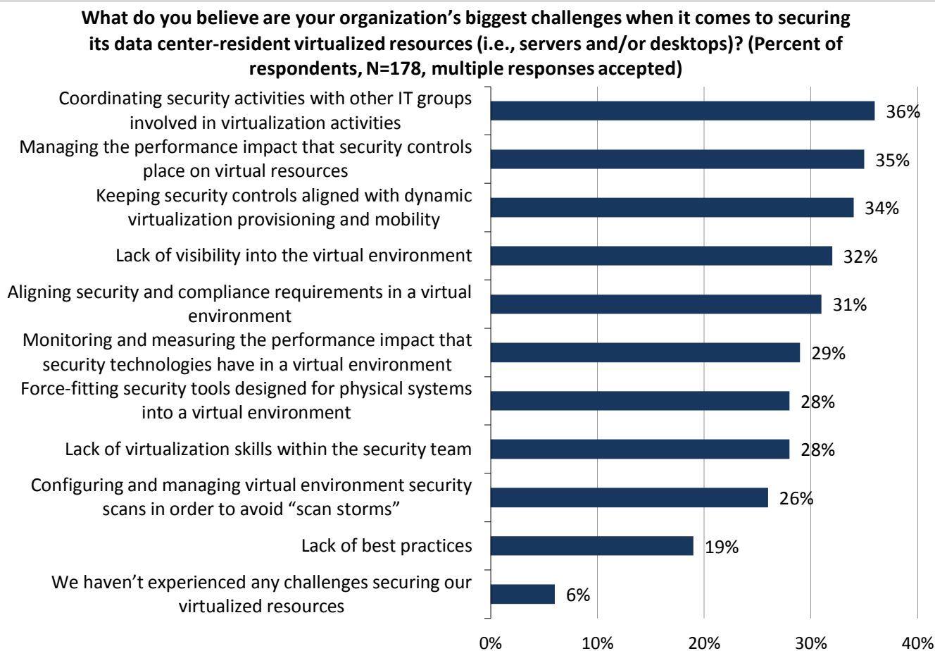
Figure 2. Organizations' Biggest Challenges When Securing Data Center Virtualized Resources