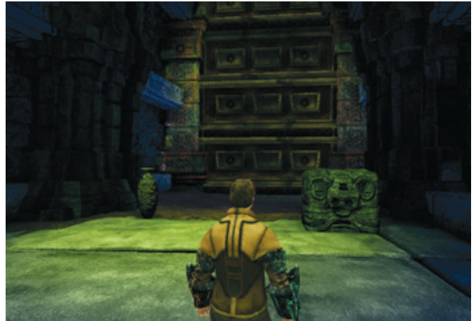
Comparison of image texture 1.5 seconds after loading a level: PC with hard drive (LEFT); PC with Intel® Solid-State Drive (RIGHT). (See lines on coat, detail in cube, and detail inside the structure.)

performance when batch rendering a dynamic animated element. The results from the game-development tests were clear, with the performance of the Intel SSD surpassing the Hitachi drive.