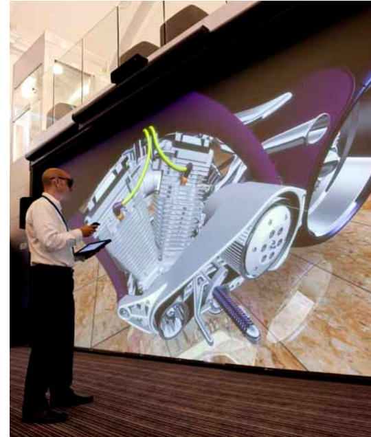
Similar system at NVISION, UK