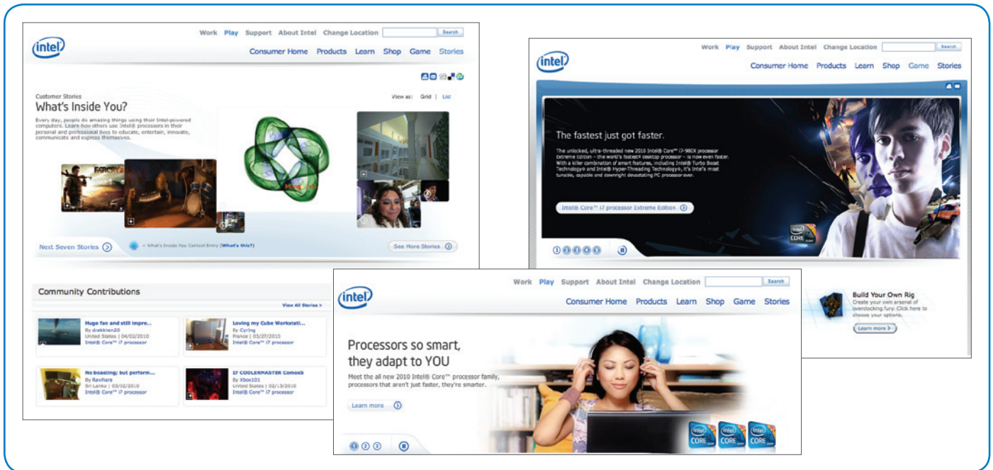
Figure 1. Intel’s consumer Web site includes interactive and social media capabilities.

charged with developing the Web site. Delivering the new Web site capabilities required investment in new hardware, software, and social media solutions.