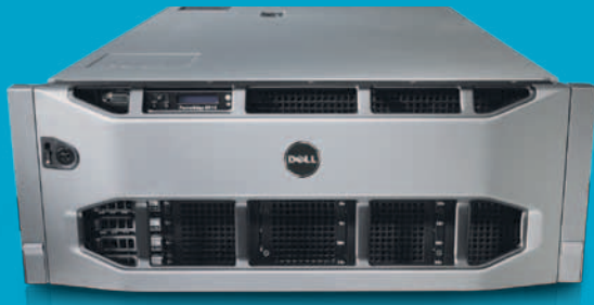
Dell PowerEdge R910 rack server with the Intel Xeon processor architecture