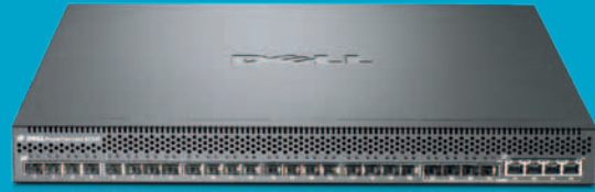
Dell PowerConnect 8024, a 24-port 10GbE Layer 3 switch for mixed cabling environments