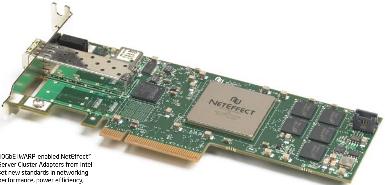
10GbE iWARP-enabled NetEffect™ Server Cluster Adapters from Intel set new standards in networking performance, power efficiency, and operational simplicity

By simplifying the path to high-performance, cost-effective clusters, Intel and Clustercorp provide a well-marked path for end-customers. Intel Cluster Ready offers organizations an expertly engineered solution that delivers cutting-edge infrastructure while minimizing in-house effort and risk.