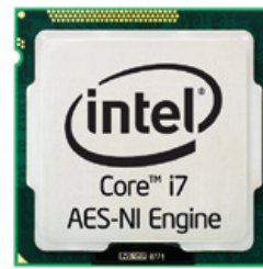
Figure 1. Intel® Core™ i7 processor with Intel® AES-NI Engine

Deploying a strong security model, YCD implements end-to-end protection starting with its YCD|Platform* central distribution system that encrypts audio and video content before sending it to YCD|Player* stations, which then decrypt the content in real time during playback. The players also check that any stored content was properly encrypted by the YCD|Platform before playing it. Both platforms and players use Intel AES-NI security instructions to maximize performance and minimize the computing workload needed to support encryption/decryption.