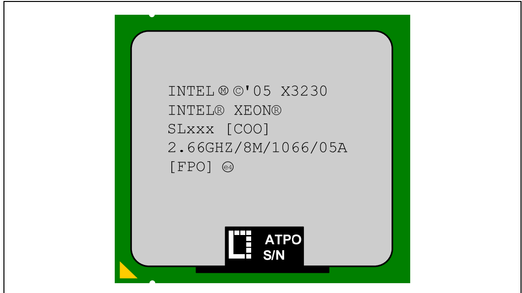
Figure 1. Quad-Core Intel® Xeon® Processor 3200 Series Package